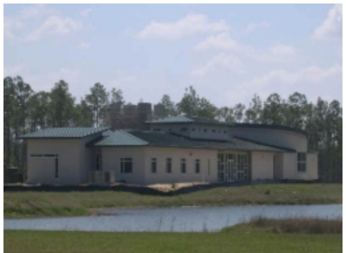
The brand-new, just-about-to-open Sugden Visitor Center at Florida Gulf Coast University.