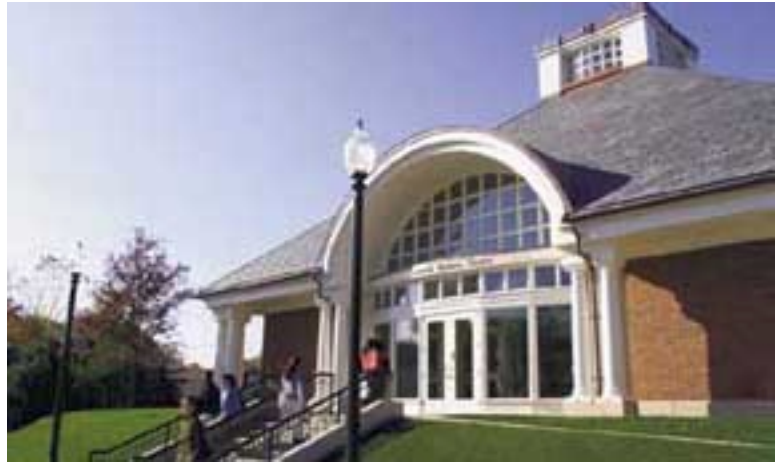
The University of Connecticut's Lodewick Visitor Center

The second day of our conference will be spent in Storrs, home to the University of Connecticut . Regarded as the top public university in New England, UConn blends exceptional academics with a vibrant athletic tradition (UConn is currently home to both the Men's and Women's National Basketball Champions!). It is a campus rich with traditions, honoring its agricultural heritage while continually expanding its cutting-edge research facilities, arts offerings, and the beauty of its campus. Recently, UConn created a vehicle-free Pedestrian Core at the center of campus featuring brick plazas and pathways that are conducive for meeting, exchanging ideas, and enjoying University life.