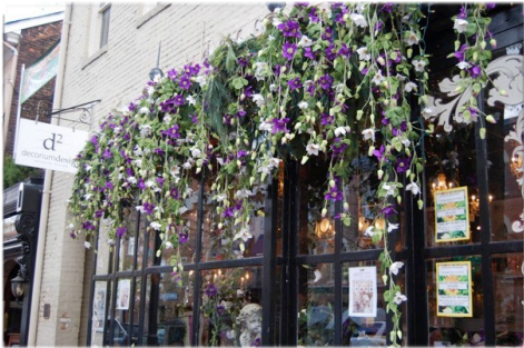
Shopping in Old Town Alexandria