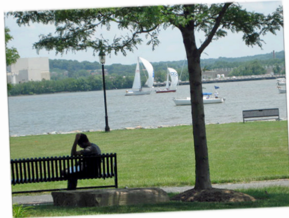
Old Town Alexandria and the Potomac River

Open Up – Open your mind to ideas, methods, and processes of others! Large public universities can learn so much from small community colleges or private schools and vice versa!