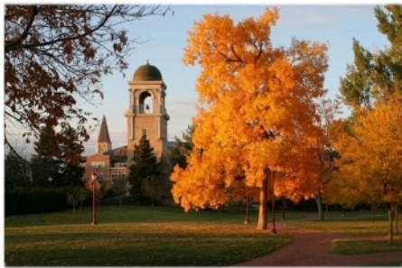
Beautiful fall foliage on the University of Denver campus.

Collegiate Information and Visitor Services Association